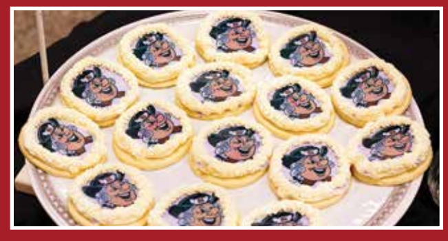
Quaker Sam made an appearance at the event via iced sugar cookies.