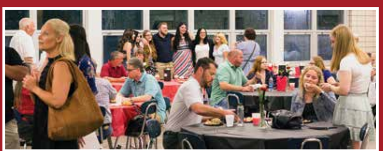
A group of 2022 graduating seniors celebrated their achievements and close friendships in front of the SHS cafeteria windows.