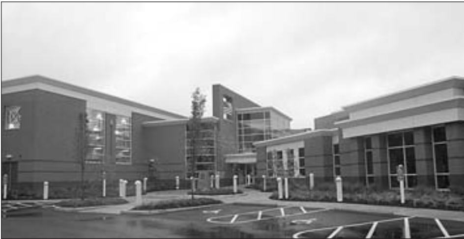
Everyone is welcome at the Salem Community Center.