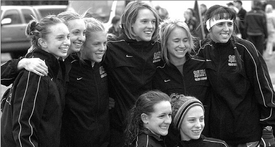
The Salem News