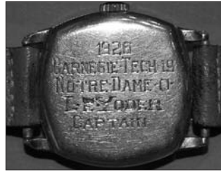
Engraved on the back of the watch: