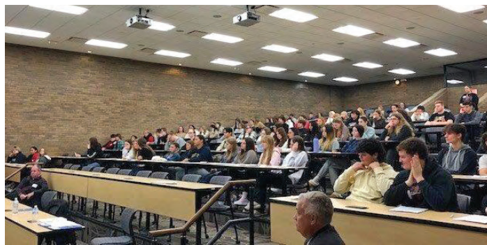
The morning session of the SHS Career Day was held in the lecture hall of the KSU Salem campus.

The morning's informative career discussions included