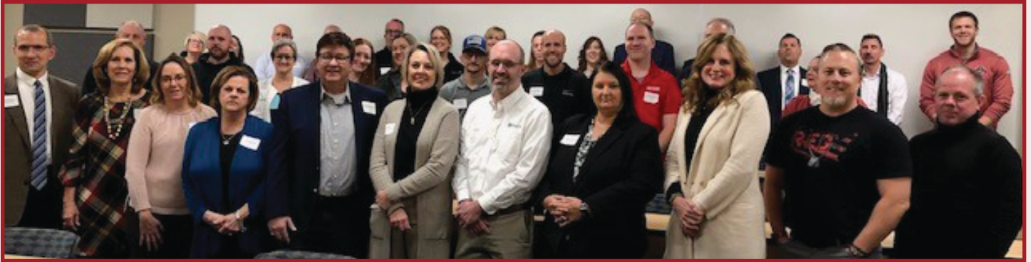
SHS Career Day volunteers gathered for a picture after enjoying lunch and before joining students in the afternoon break-out sessions.

Salem High School sophomores took a significant step toward their futures at the annual SHS Career Day held at the Kent State University at Salem campus on Friday, November 22, 2024. The event, designed to provide students with insights into various career paths, was a collaboration between the Salem High School Alumni Association and the Rotary Club of Salem.