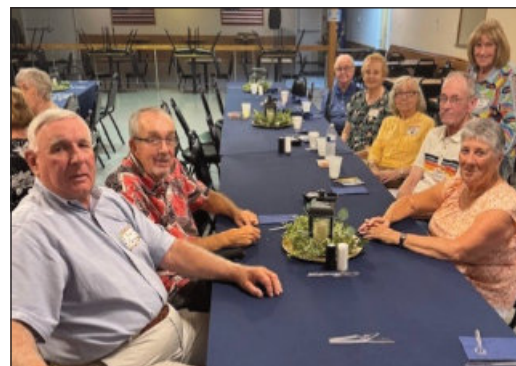
SHS Class of 1960 members enjoyed a Saturday luncheon during the 2025 SHS Alumni Weekend.