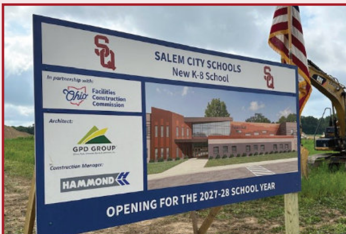
A sign of the times stands proudly at the site of the new K-8 school, now under construction across from Southeast School in Salem.

The 65-acre property - known as the Whinnery Farm - was generously donated to the district by the Salem Community Foundation in 1990. The project is funded 66% by the Ohio Facilities Construction Commission and further strengthened by a $10 million contribution from the Salem Community Foundation. The groundbreaking marked an exciting new chapter for Salem City Schools, and it reflected a shared commitment to investing in the future of Salem students. GO QUAKERS!