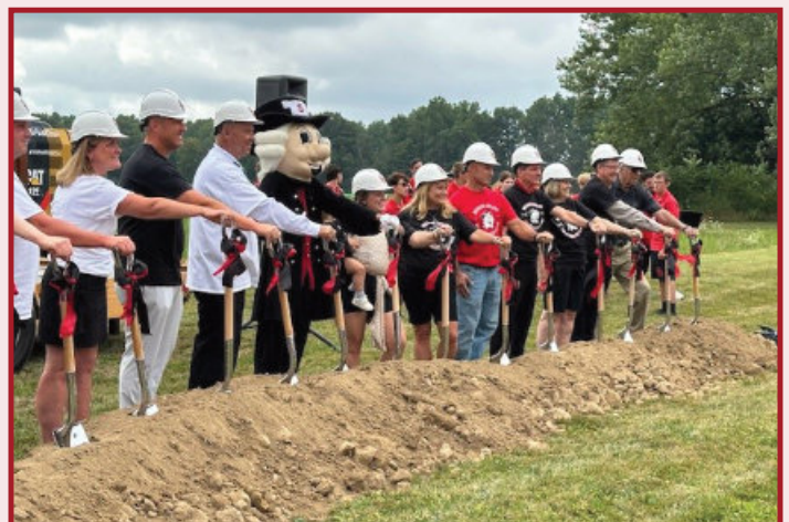
Quaker Sam joined school and community officials as they prepared to turn the first shovels of dirt at the August groundbreaking ceremony.